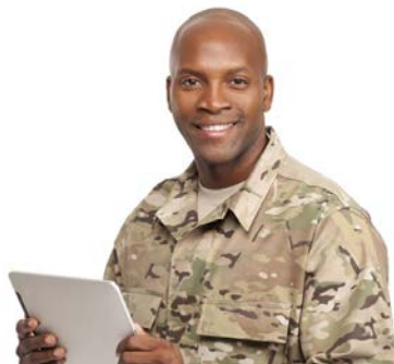
Men between 18 and 25 years of age must register for the Selective Service.