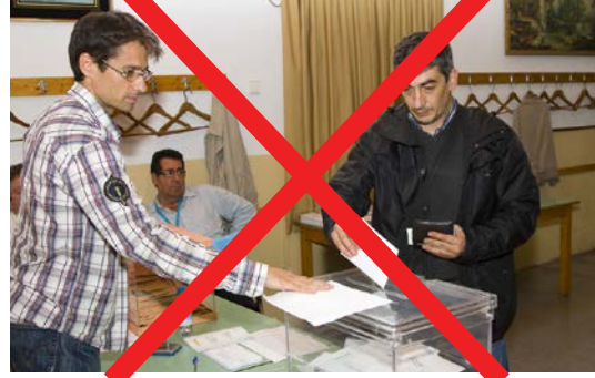
Know the law: Non-citizens cannot vote in any election.