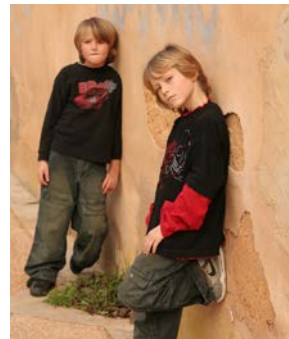
Know the law: Young children must be supervised.