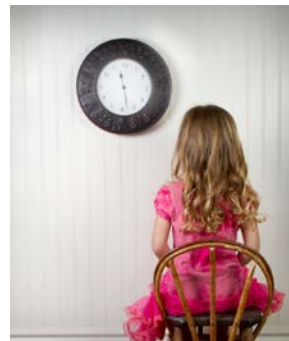
Parents must learn legal ways to discipline their children.