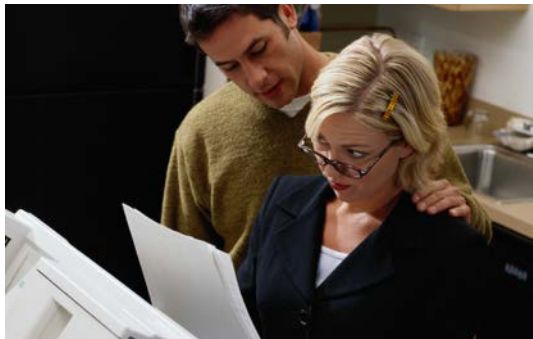
Know the law: Sexual harassment is illegal.