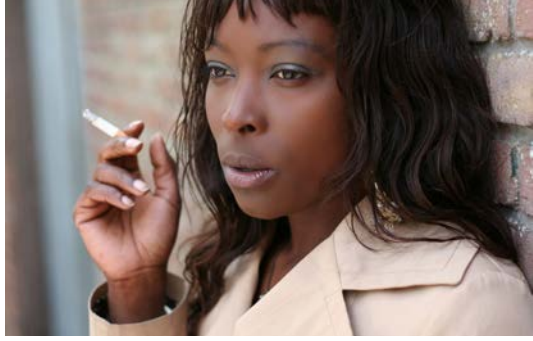
Know the law: It is illegal to smoke tobacco if you are under the age of 18.