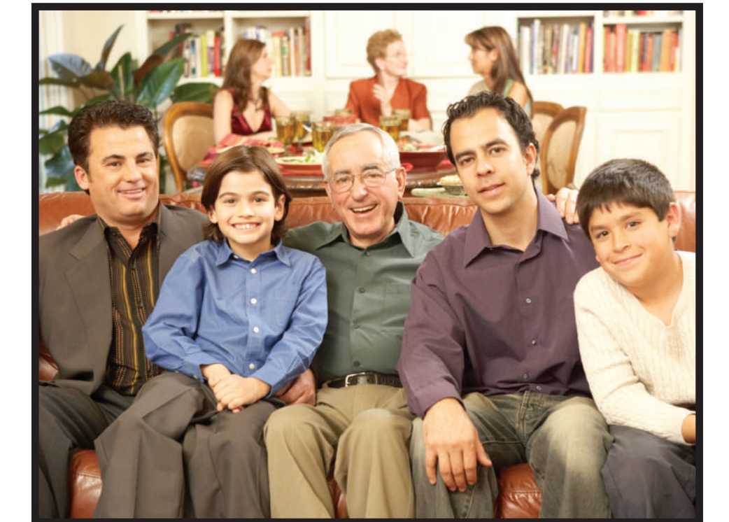
Shared Living Situation

Housing can be very expensive. The cost of living may include rent, utilities, food, phone, transportation, childcare, your travel loan, and healthcare. Upon arrival, you will be provided with basic housing, food, clothing, and furniture.