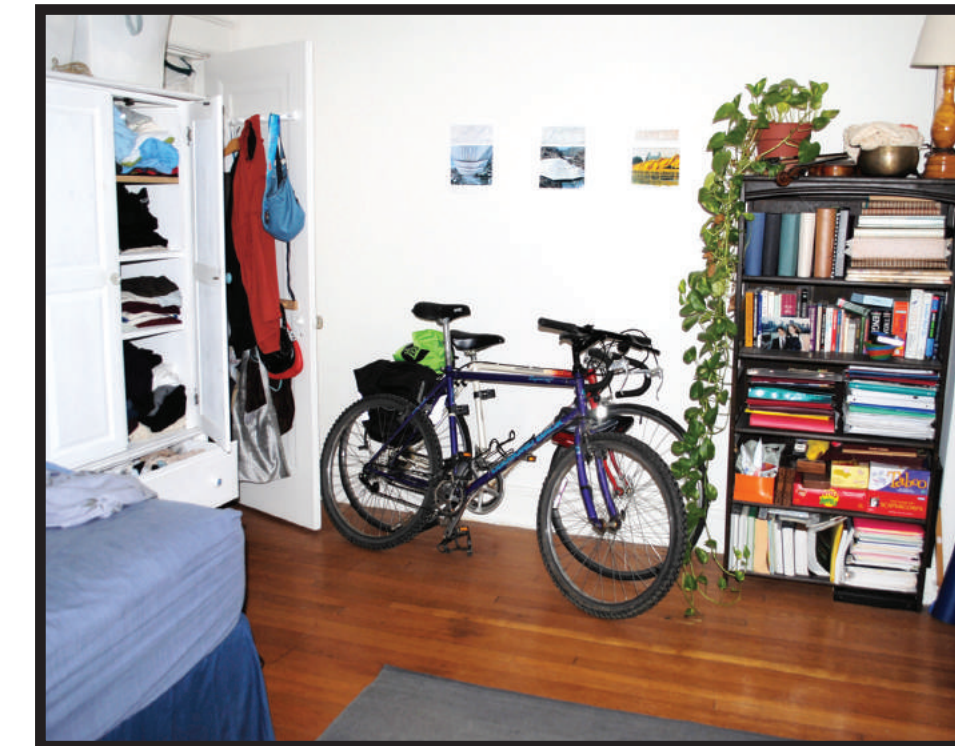
Room in House or Apartment